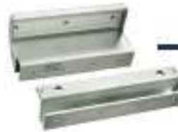
UB-280GZ For Fully Frameless Glass Door